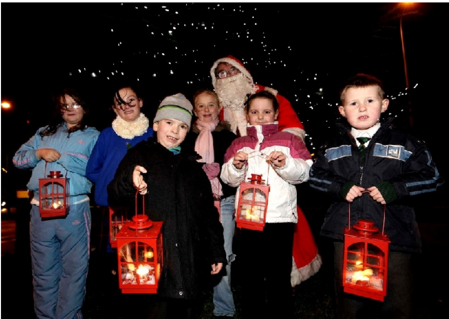
Inter-community carol singing – Christmas 2008. Fairy lighting has been fixed to a 30 foot Atlantic Cedar - to provide a Christmas tree on the interface.