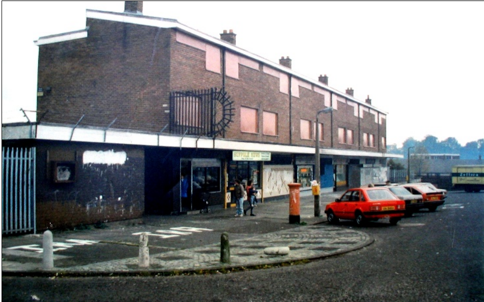
Before regeneration c. 1999