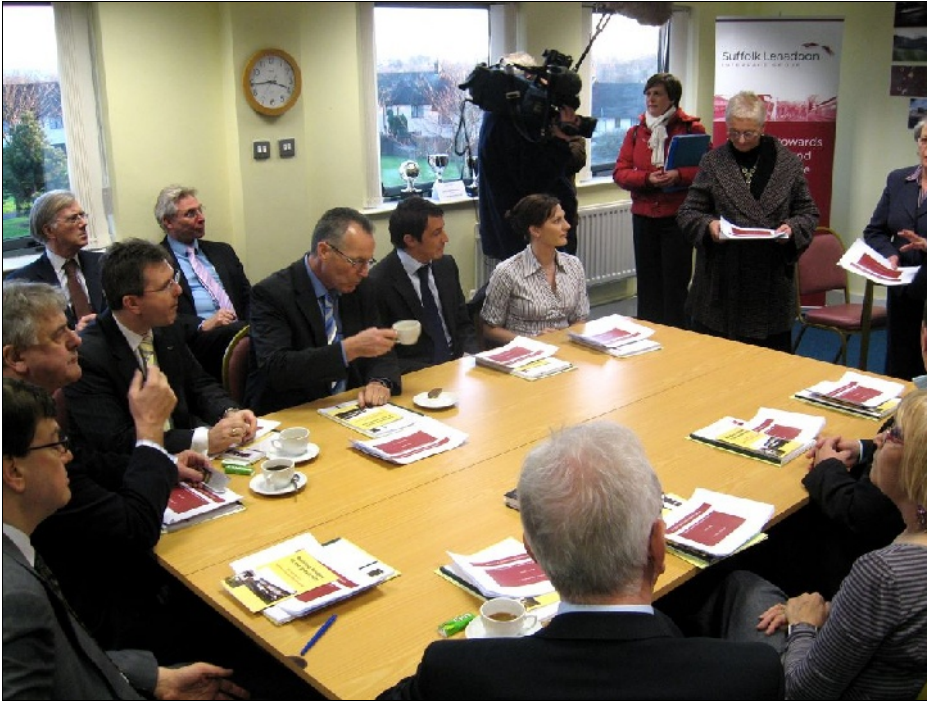
Deputy First Ministers Gerry Kelly MLA and Jeffrey Donaldson MP – along with Jim Nicholson MEP and EU Parliament President Hans-Gert Pöttering MEP meeting with representatives of the Suffolk and Lenadoon communities – November 2008