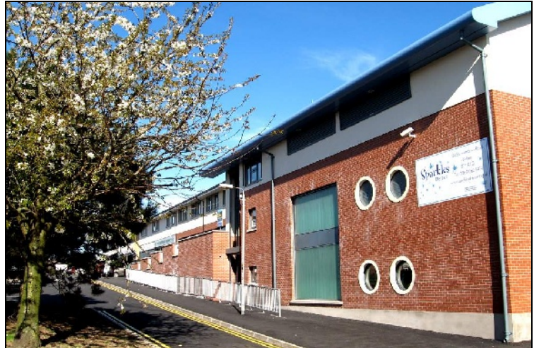
New 50 place children's day care centre and commercial retail extension – opened in 2008 – at a cost of £1.36M

Construction of a second phase of development including retail and office space and a 50 place children's day care centre was completed in early 2008. The final account was signed off in May 2009 after correction of outstanding defects. Over £94,000 (almost 7%) of the capital funding for this development was provided from the company's retained profits. During the reporting year all new office and retail units were leased. Altogether the company now leases 19,115 square feet (sq.ft) (with an additional 3,254