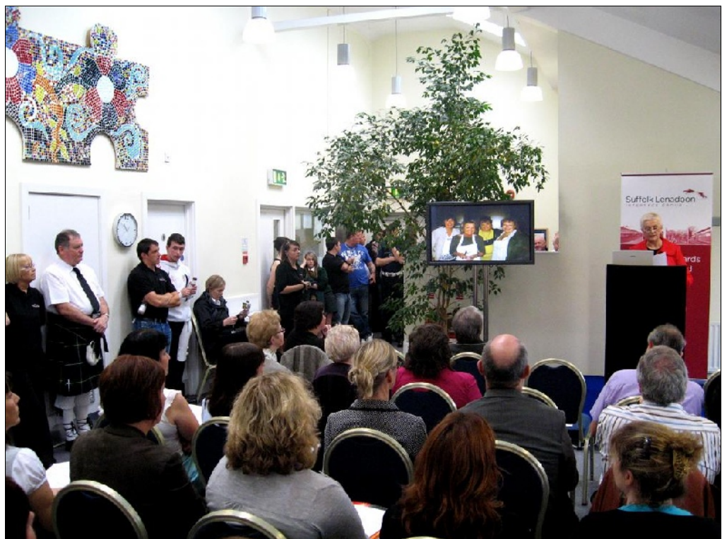
Launch of the Suffolk Lenadoon Interface Group's strategy document "The Interface and Beyond: 2008 - 2013" – September 2008. The Suffolk based Upper Falls Protestant Boys flute band played along with the Lenadoon based Ghleann Collain Irish pipe band at the event.