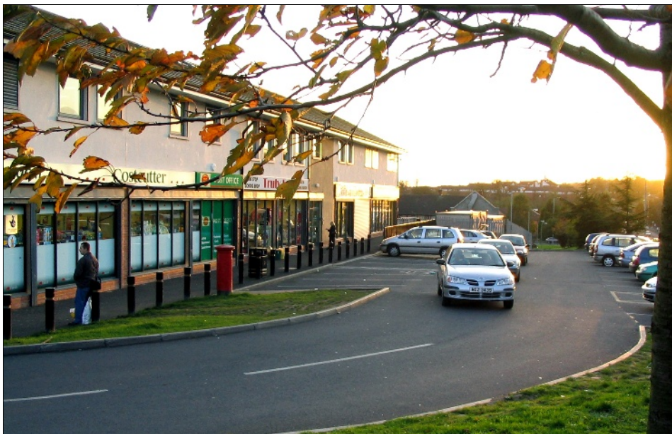
After regeneration c. 2003